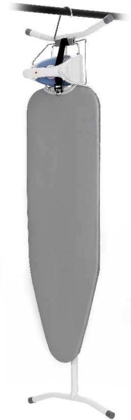
Actual size W 34 x H 97 cm