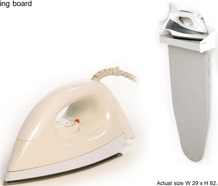
Actual size W 29 x H 82.5 cm

Installation is quick and easy using the screws provided.