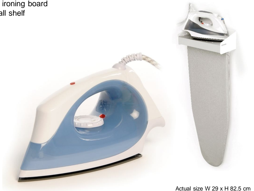
Actual size W 29 x H 82.5 cm

Installation is quick and easy using the screws provided.