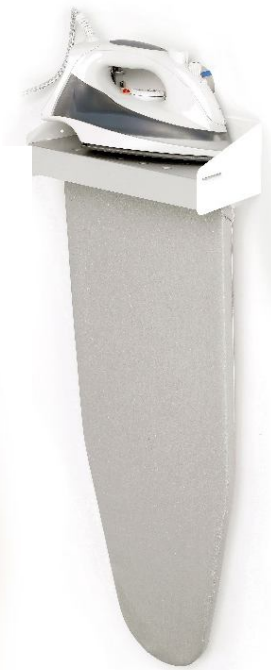
Actual size W 29 x H 82.5 cm