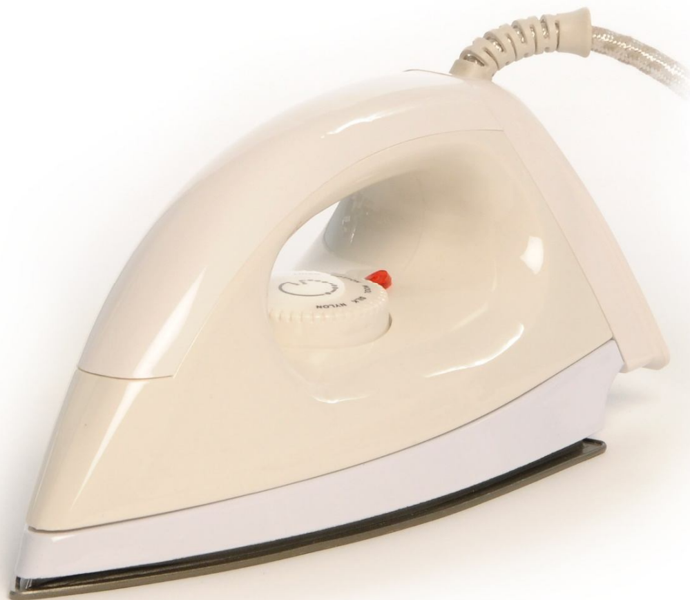
Standard dry iron

The floor standing ironing centres now has a super lightweight, all metal mesh board and comes with a choice of either standard dry iron, dry iron with a safety cut-out motion switch or a steam iron with the same motion switch system. The motion switch system ensures the iron cannot be left unattended for long periods.