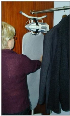
Floor standing centres can be folded neatly away

The floor standing ironing centres can be adjusted to 6 different heights and an elastic strap retains the iron when not in use, so it can be stored away neatly. An iron retention kit is also supplied.