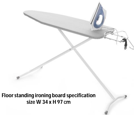
Floor standing ironing board specification size W 34 x H 97 cm

Floor standing ironing centre replacement order code: