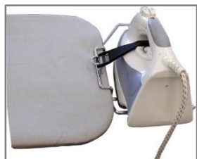
Iron retention kit supplied with floor standing centres

Either Dry iron / Dry iron with motion switch / Steam iron with motion switch