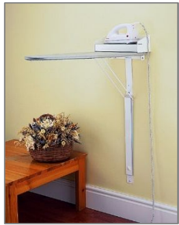
Quick & easy installation

Bower Products is a family business with more than 30 years' history of providing a comprehensive range of quality products to the Pest Control, Hygiene and Hospitality industries.