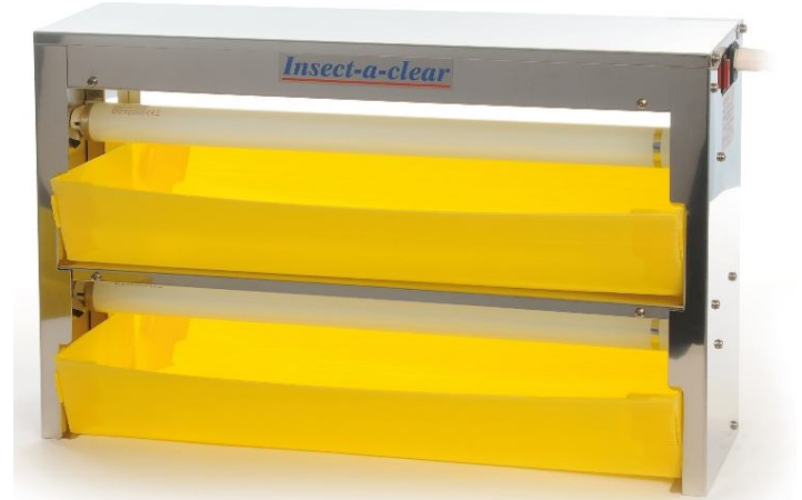
Actual size W 62.5 x H 38.5 x D 25 cm (without dust guards)

All machines are supplied with extension dust guards (not shown).