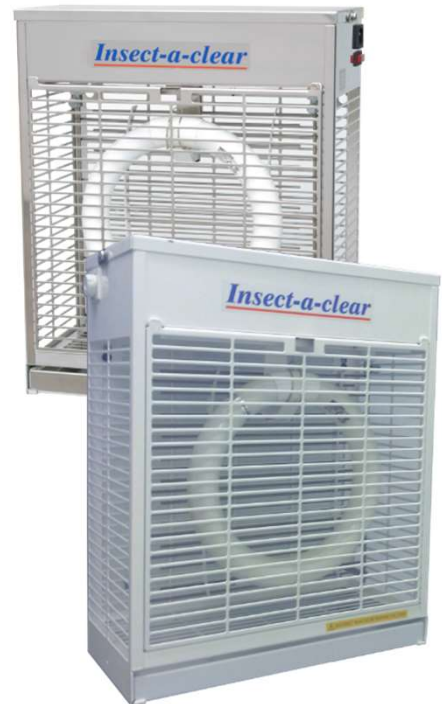
Actual size W 32 x H 39.5 x D 15 cm

All models can be wall mounted, free standing or suspended..