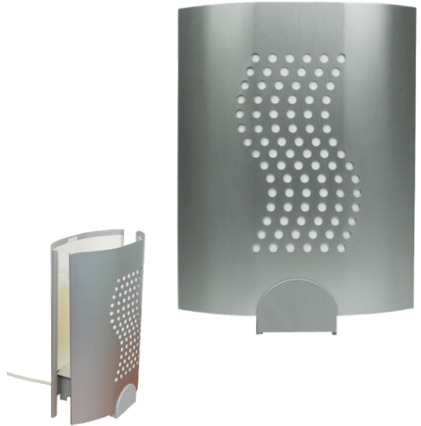
Actual size W 34.5 x H 25 x D 11.5 cm

By combining its powerful 20w, energy saving ultra violet lamp with its large unobstructed glue boards, Insect-a-clear have come up with a truly effective unit.