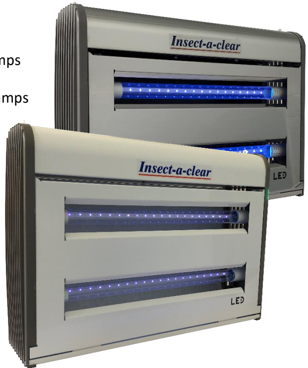
Actual size W 50 x H 35.5 x D 12 cm

The Nano 4 LED addition continues the range of the Insect-a-clears with the introduction of LED technology. It ensures even less power consumption than normal electronic ballast machines. The lamp driver is located IN THE LAMP, thus when changed, ensures a 'new machine'. No more replacing expensive drivers after a few years. It is a professional UK manufactured glue board insect control machine suitable for restaurants, kitchens, food shops etc. where flying insects pose a problem. Made for wall mounting, suspending or free standing; the 'lift and lock' front guard enables tools free servicing. With competitive pricing and the option of white or stainless steel, make this a very popular model