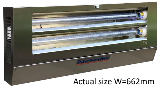
Actual size W=662mm H=265 D=100