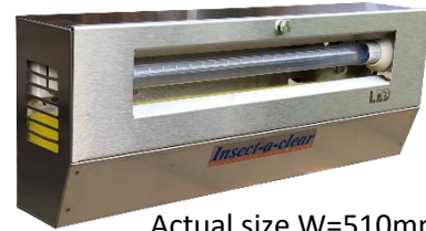
Actual size W=510mm H=190 D=100