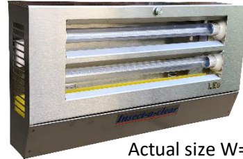
Actual size W=510mm H=265 D=100