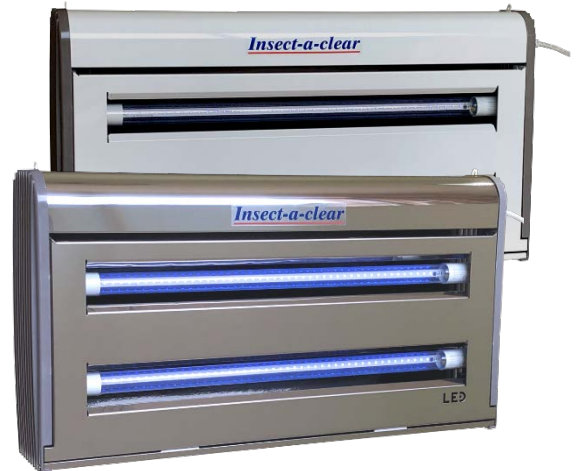
Actual size W 65 x H 35.5 x D 12 cm

stainless steel, make this a very popular model