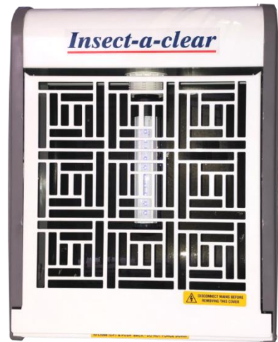
Actual size W 28 x H 35.5 x D 12 cm

FGN1SW Nano G1 LED in white. FGN1SS Nano G1 LED in stainless.