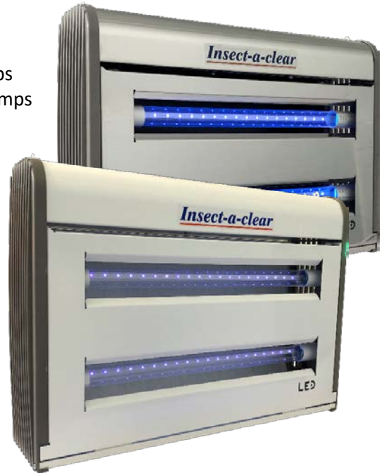
Actual size W 50 x H 35.5 x D 12 cm

stainless steel, make this a very popular model